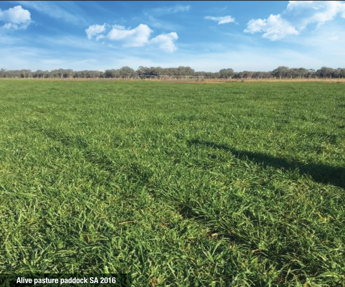
Alive pasture paddock SA 2016