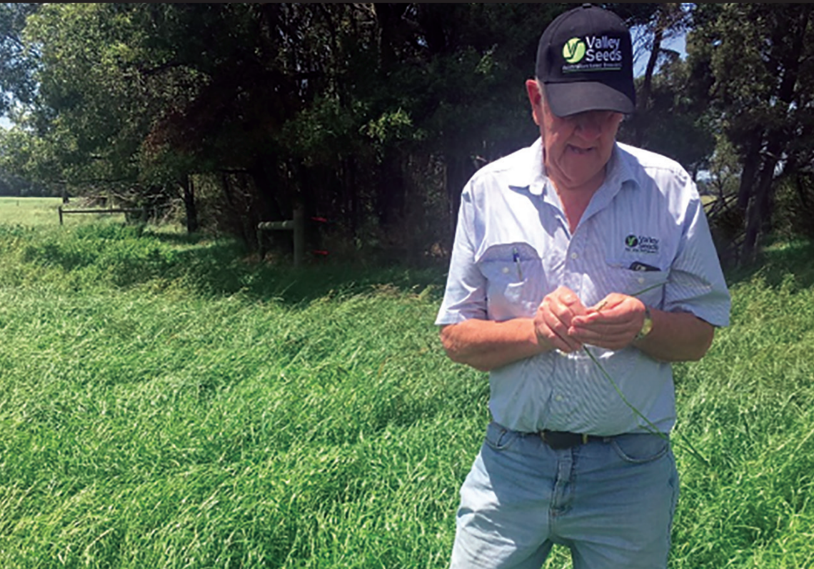
Valley Seeds production agronomist assessing Cantina seed crop in Gippsland, Victoria.